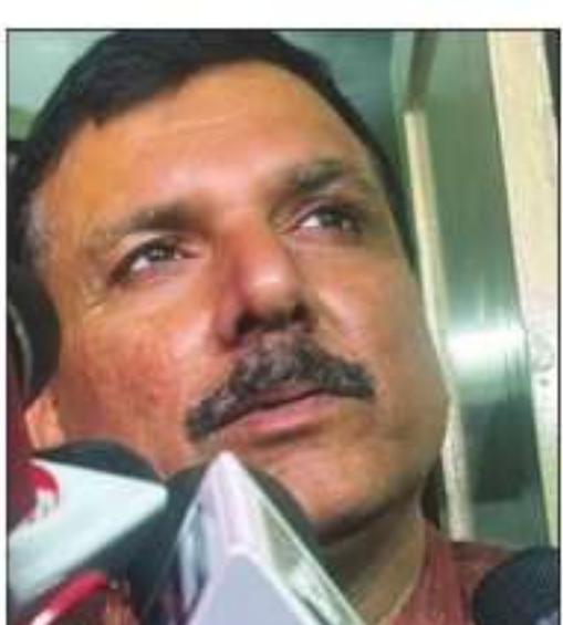
Singh's release has come at a time when AAP is in the middle of its worst-ever crisis

A part of opposition's INDIA bloc alliance, Aam Aadmi Party is contesting a total of 22 Lok Sabha seats spread across five states, including 13 in Punjab where it is going all alone. It has managed a seat-sharing arrangement with Congress in Delhi, Gujarat, Haryana and Assam, contesting four, two, one and two seats, respectively. While Mann is likely to lead the campaign in Punjab, sources said