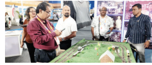
कोंकण रेल्वेच्या अभियांत्रिकी कुशळतायेची म्हायती दितना अधिकारी.

कोंकण रेल्वेच्या दालनांत कोंकण रेल मार्गा वयले बोगदे आनी अभियांत्रिकी कुशळतायची म्हायती दिवपाची वेवस्था रेल्वेन आपल्या दालनांत केल्या. लोक ह्या दालनाक भेट दिवंक म्हायती घेतना दिसतात. 3 ते 4 एप्रील अश्या दोन दिसांच्या ह्या ट्रॅव्हल मार्टांत पर्यटन ऑफर आनी