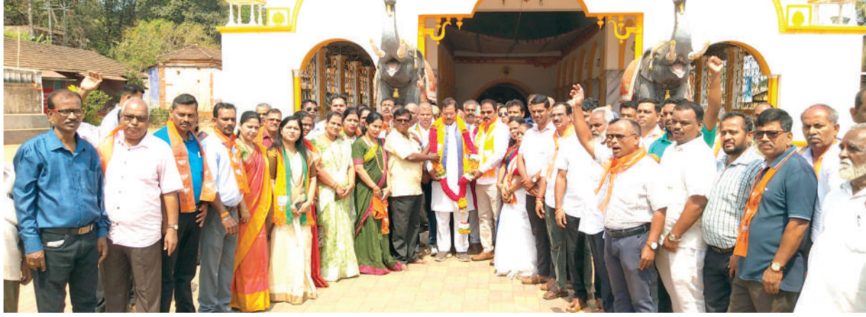
उत्तर गोंयांतले भाजपाचे उमेदवार श्रीपाद नायक भगवती देवीचें दर्शन घेवन प्रचाराक सुरवात करतना. वांगडा आमदार प्रवीण आर्लेकार आनी हेर वावुरपी.

पेडणे: संसद ग्राम उदरगत येवजणे खाला उत्तर गोंयचो खासदार श्रीपाद नायक हांणी पेडणे तालुक्यांतलो इब्रामपूर व्हो गांव आदर्श गांव करपा खातीर वेंचून काडिल्लो. मात तांणी त्या गांवांत कसलेच तरेची उदरगत केली ना अशे आरोप जावपाक लागले. आतां सव्हे फावट उत्तर गोंयांत लोकसभा वेचणुकेच्या प्रचाराक सुरवात करतना जमीन धनयांनी वेळार ना हरकत दाखले दिवंक नाशिल्ल्यान आदर्श गांव करपाक आडमेळे आयले अशें सश्टिकरण पत्रकारां कडेन उलयतना तांणी दिला.