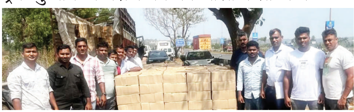
गोंय गुन्यांव अन्वेशण पंगडान सोन्याची येरादारी करपी जप्त केल्लो ट्रक आनी सोरो.