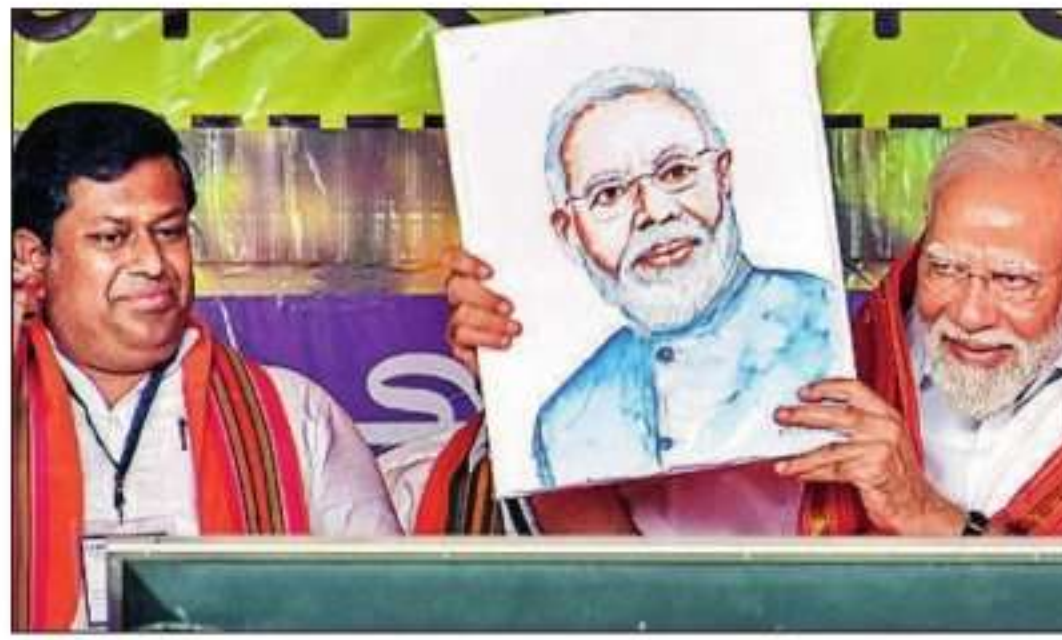
PM Modi & WB BJP president Sukanta Majumdar in Cooch Behar

Modi highlighted both corruption and Sandeshkhali to show how Trinamool was actively working against the people of Bengal. "The country has seen how the entire state machinery was used to protect the tormentors of Sandeshkhali. We have vowed to punish them," he said. "Trinamool is also trying to save those involved in